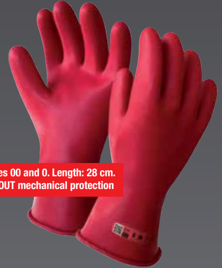
Classes 00 and 0. Length: 28 cm. WITHOUT mechanical protection