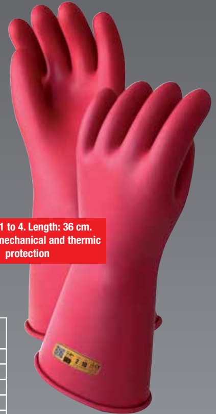
Classes 1 to 4. Length: 36 cm. WITHOUT mechanical and thermic protection