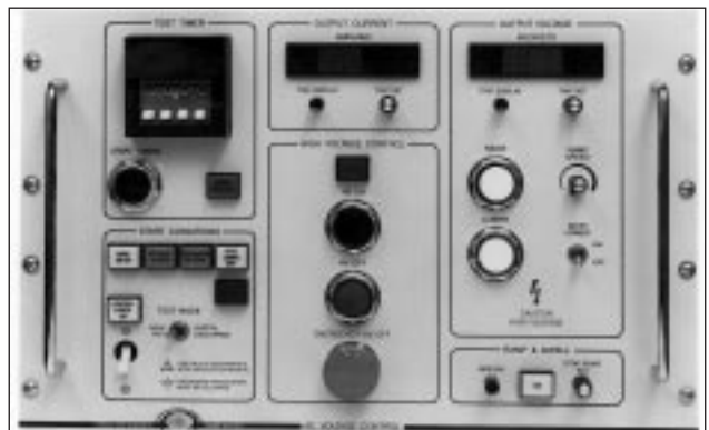
Optional control panel

Special length cable extension assemblies with mating connectors at both ends are available. Specify the cables and lengths needed.